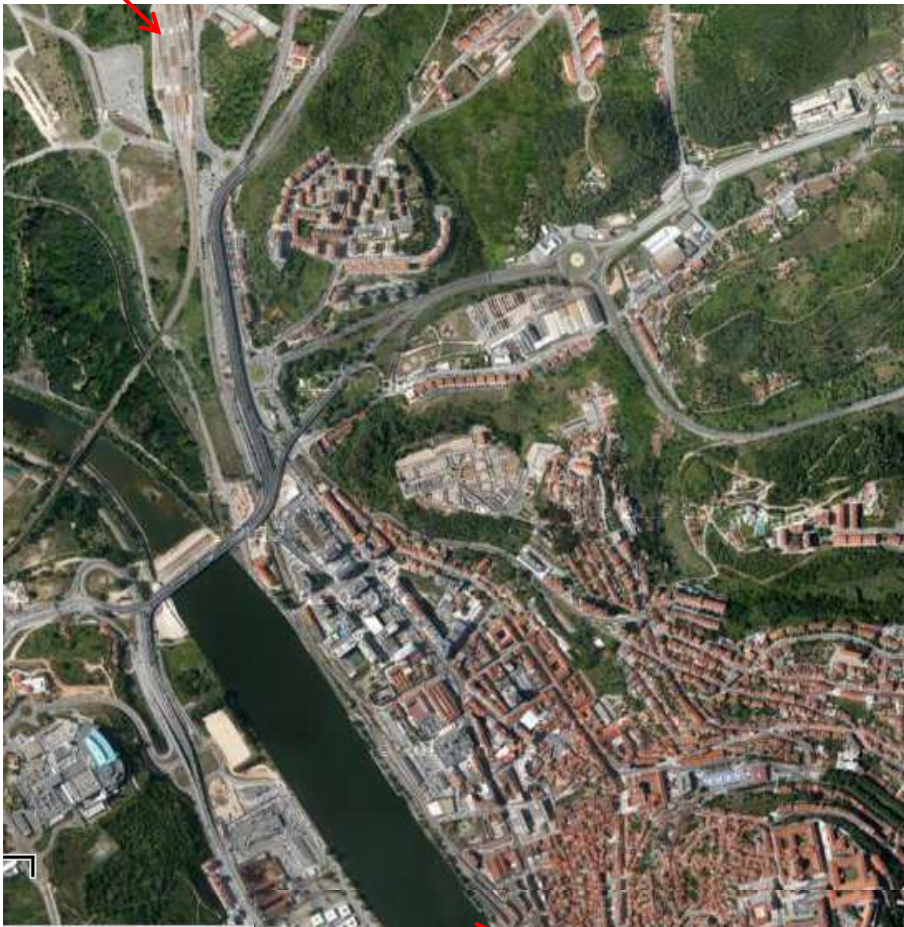
Central Train Station