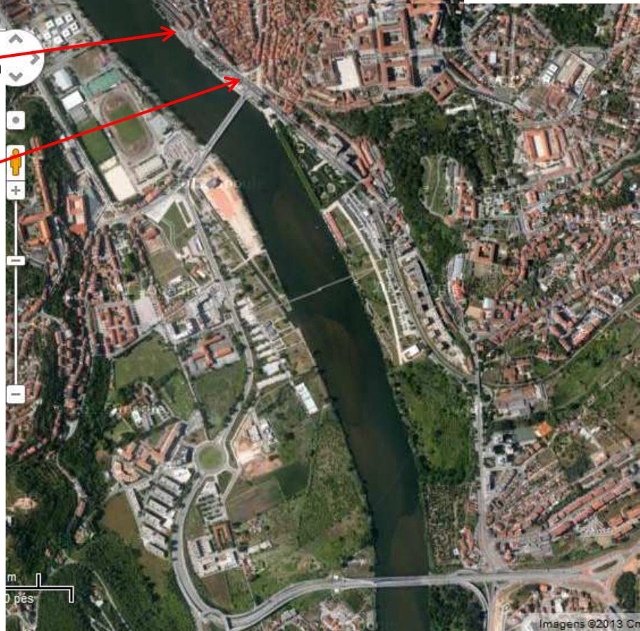
Largo da Portagem Portagem/ Beira Rio